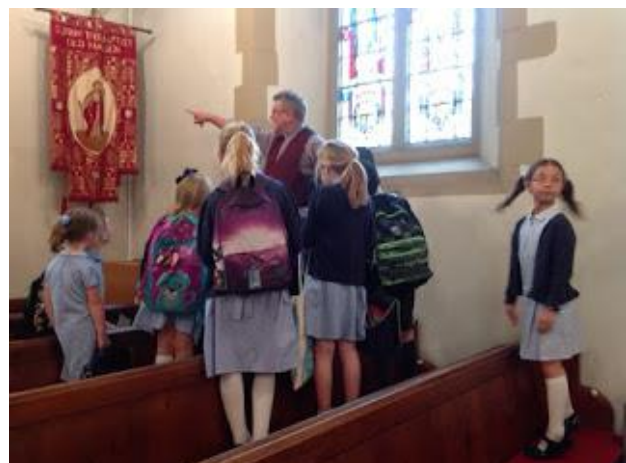
MPS children visiting church at Heritage weekend.