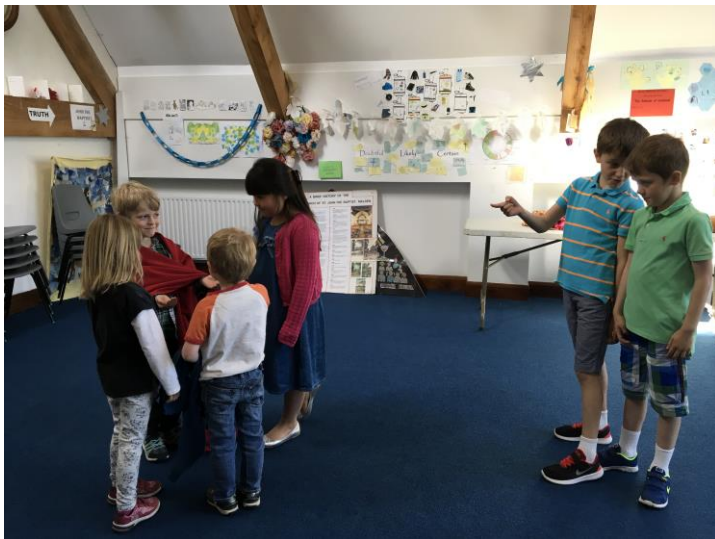
Acting out a Bible Story

Young people play an active role on the serving team, as well as the welcomers and sidespeople teams. In addition, St John's has junior choristers who follow the RSCM's 'Voice for Life' scheme.