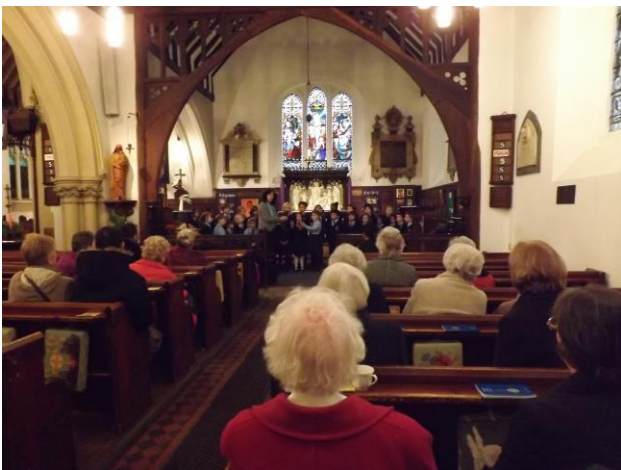
Children of MPS entertain Mothers Union

Traditionally there have been good links with St John's. The Eucharist is held twice a term in the school. In addition, the Vicar takes collective worship once a week. The school visits the Church once a term for services including Christmas, Ash Wednesday, Easter and an end of school year service. St John's also provides Foundation Governors.