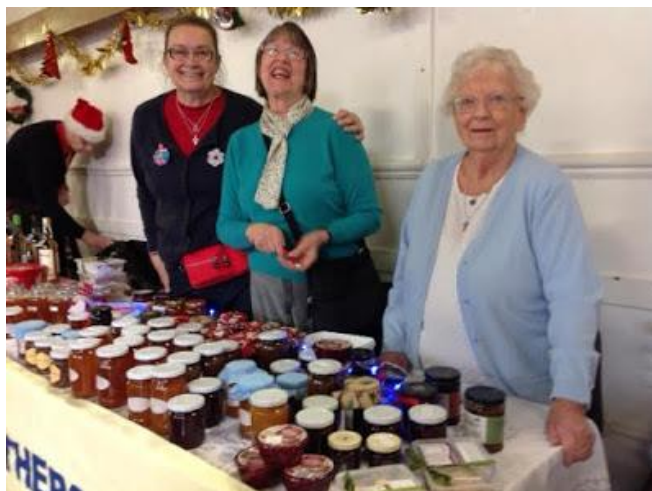
Mothers' Union selling their wares at the Christmas Fair.

St John's is an active branch comprising 24 members and meets in church twice a month. Some MU members help out with teas at Toddler Group and Praytime.