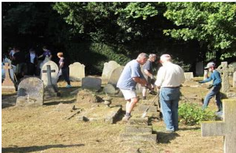
Helping hands at the annual churchyard working party.

On our last quinquennial report in July 2017, the architect noted ‘the building provides a very good standard of accommodation and facilities and the extensive accommodation is well-maintained and in sound structural condition’.