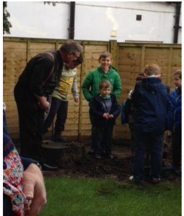
The children resurrected "Alleluia" which had been buried at the beginning of Lent.