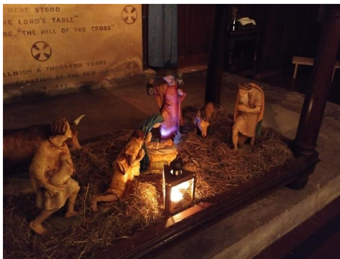
Christmas Day at St John's