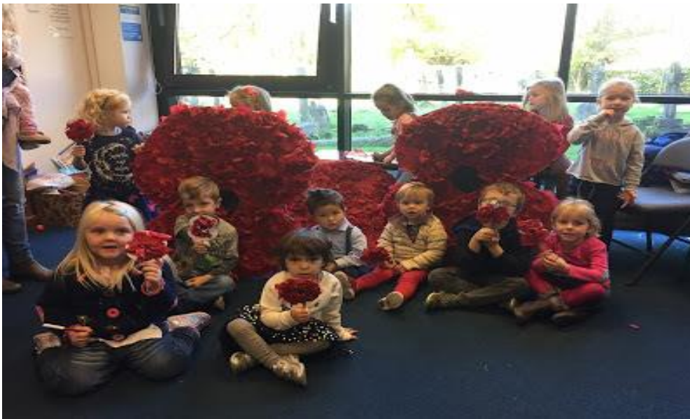
'Little Fishes' making poppies for Remembrance Sunday