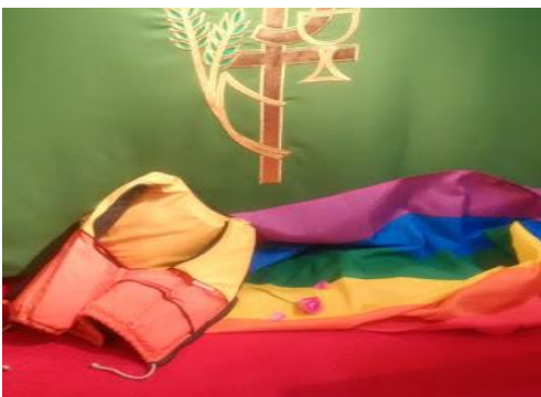
Prayers of lament at St John's.

Much of our worship focuses on the Eucharist and we use Common Worship for our liturgy. Our worship is colourful, drawing on both traditional and contemporary aspects of catholic liturgy. Our theology is liberal and seeks to be radical. Lay participation is an integral part of our Services. We have an open baptism policy; we welcome couples to be married including those that have previously been divorced; we care for the departed and comfort the bereaved. We remember those who have died in a Service of Remembrance and in our regular intercessions.